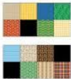
Sew Two Rows